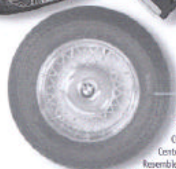
Hubcap - for R1200C-R1100/L1500S/R Smooth Chrome - BMW Logo Fits in Center (not included) Remembers Vintage Slash 2 Hubcaps. $199.95