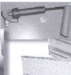
Co2 Dispenser and Hand Pump Combination - $27.95