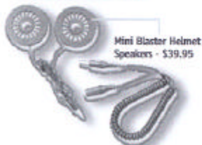
Mini Blaster Helmet Speakers - $39.95