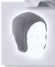
Cool Max Helmet Liner - The best helmet liner made! SM, MD or LG/XL $14.95