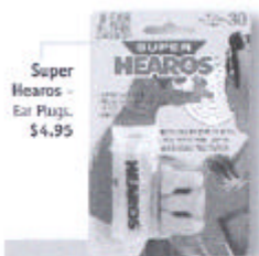
Super Hearos - Ear Plugs. $4.95