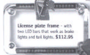
License plate frame - with two LED bars that work as brake lights and tail lights. $112.95