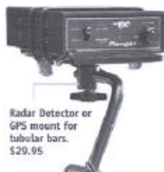
Radar Detector or GPS mount for tubular bars. $29.95

The A&S BMW website. Over 2500 BMW motorcycle accessories, riders wear and lifestyle products on-line...all the time.