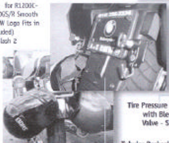
Tire Pressure gauge with Bleed-off Valve - $21.95