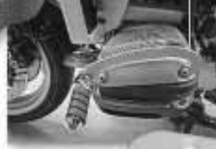
Footpeg & Mounts - Fits all R850, R1100, R1150. Price for one pair is $159.95