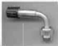
Angled Tire Valve Stem - Makes checking tire pressure much easier. $9.92