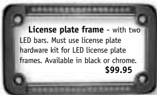
License plate frame - with two LED bars. Must use license plate hardware kit for LED license plate frames. Available in black or chrome. $99.95

The A&S BMW website. Over 6500 BMW motorcycle accessories, riders wear and lifestyle products on-line...all the time.