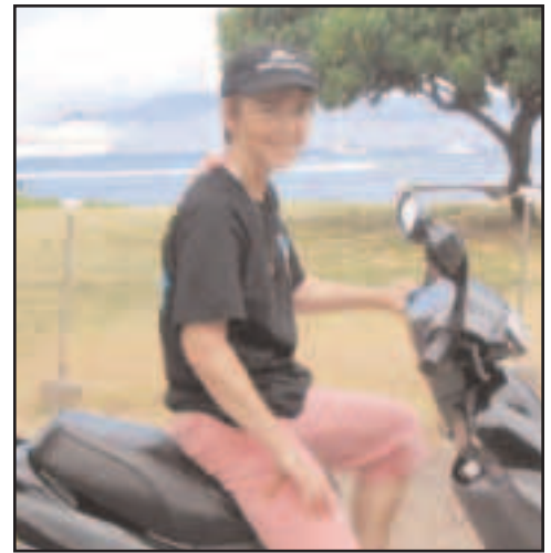
The author on her rented scooter.