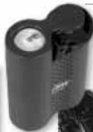
Air Compressor, Mini, Powered by Accessory Outlet - $19.95