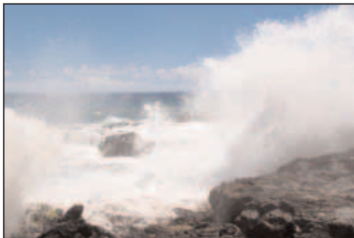
Surf spray on Kaua’i.

When I researched renting motorcycles, I found there were only a couple of places available and they rented Harleys, one type of Kawasaki Vulcan and scooters. Or you could choose to “style” around the island in a Ferrari if you had the bucks. I settled on a little scooter since the deposit