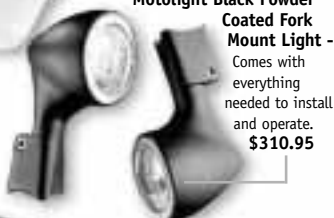
Motolight Black Powder Coated Fork Mount Light - Comes with everything needed to install and operate. $310.95