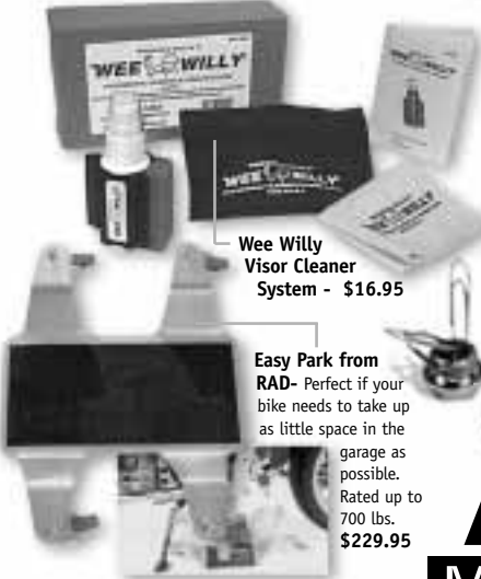
Wee Willy Visor Cleaner System - $16.95