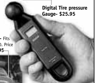
Digital Tire pressure Gauge - $25.95