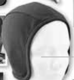
Cool Max Helmet Liner - Keeps your helmet clean. $14.95