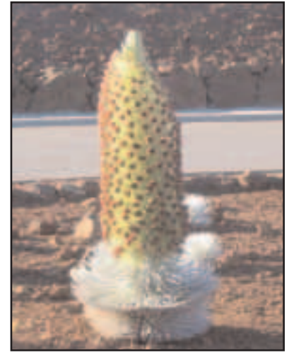
A Silversword atop Haleakala.

If you have an abject fear of heights as I do, after driving down Haleakala, stop at the Tedeschi Winery and knock back several free samples. This will not only improve your state of mind, but also prime you for purchasing extra bottles to bring home.