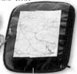
Magnetic Map Pocket for All Steel Tanks - $69.95