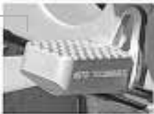
K1200RS, R1100RS, R1100RT, R1150RT, R1150RS, R850 & 1100R- $59.95