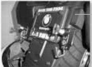
Helmet Gaurdian Helmet Lock - $49.95