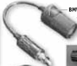
BMW Accessory Plug Adapter - Perfect for charging your cell phone on the road. $25.92