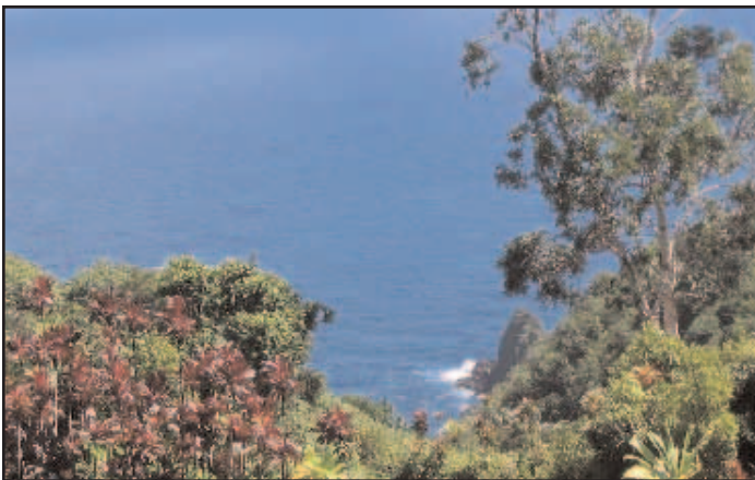
Eden on earth, from the Road to Hana.

Besides the Road to Hana, another recommended sight