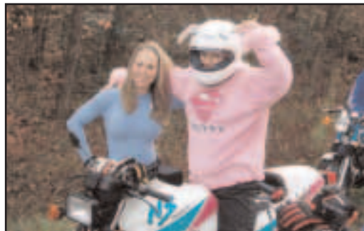
The author and her daughter.

Say you break a leg and you've let the shaving thing slide because you've man-