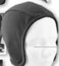
Cool Max Helmet Liner - Keeps your helmet clean. $14.95