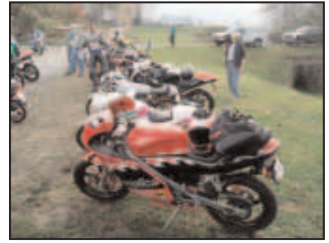
Little bike line up.

miles back caught up with me and helped me out of the road and onto my feet. He cranked my bike, made sure I was OK and watched a somewhat chagrined Super Bunny lurch off towards the finish, 2 miles down the road.