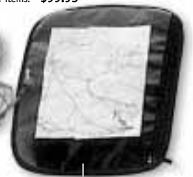
Magnetic Map Pocket for All Steel Tanks - $69.95