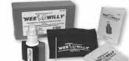
Wee Willy Visor Cleaner System - $16.95