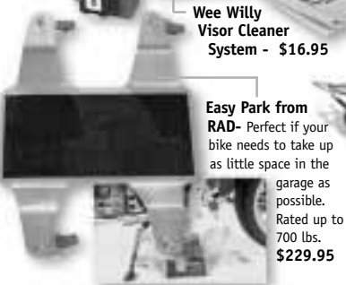
Easy Park from RAD - Perfect if your bike needs to take up as little space in the garage as possible. Rated up to 700 lbs. $229.95