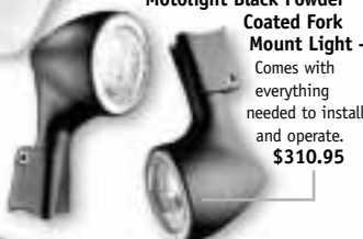
Motolight Black Powder Coated Fork Mount Light - Comes with everything needed to install and operate. $310.95