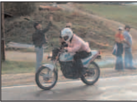
Off in a cloud of blue smoke!

what winded another thought occurred to me. If you own a motorcycle equipped with ABS brakes and one with non-ABS brakes, make sure you get it firmly planted in your head ahead of time which bike you're on if you have to brake hard.