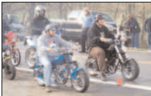
At the starting line.

Now you're getting the picture. Super Bunny's on a roll and let me tell you, she's 20 years old again and feeling indestructible. These little bikes are so compact you could easily get 3 abreast in a lane and she's passing on the left and passing on the