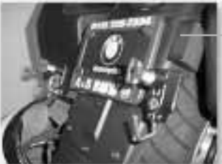
Helmet Gaurdian Helmet Lock - $49.95