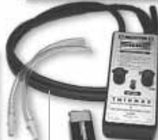
Twin max Sync Tool - Compact. Portable. Easy to use. $89.95